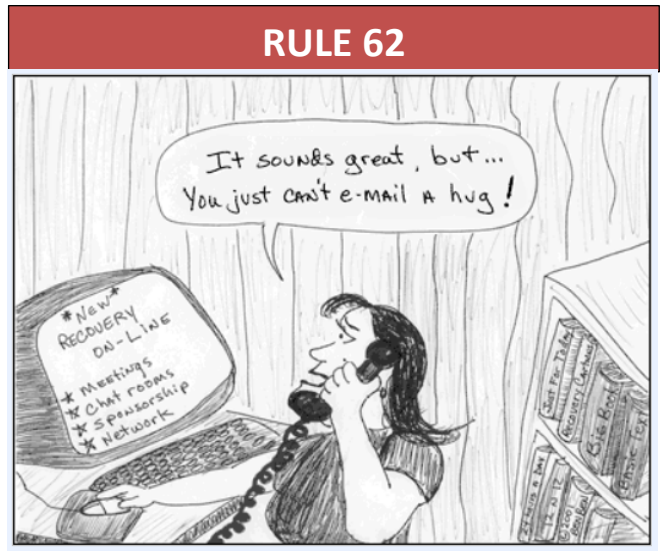
List of Face to Face meetings in District 22

Valerie Hosford, District 22 Alternate DCM